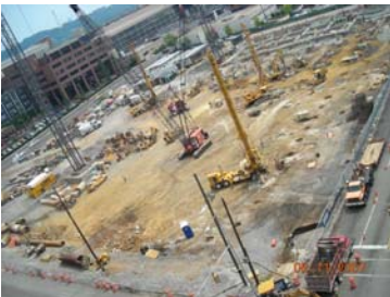
Construction began Spring, 2007

Work started on the project in April, 2007 and today all floors of the exterior portion of the building are well on their way to being completed. Interior work on the third floor is also quickly being completed.