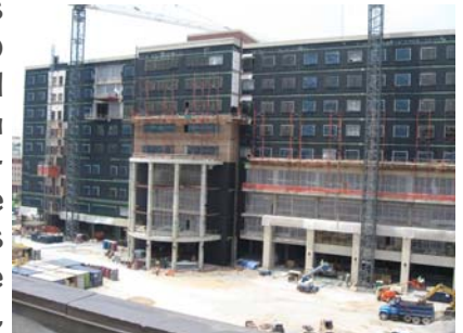
The exterior nears completion – July, 2008

the patient rooms will gain about 200 square feet. Included in every room is a designated and spacious area for the family. This provides a welcoming place for family members, as the heart and soul of patient care in Women's & Infants' Services revolves around the patient and their family.