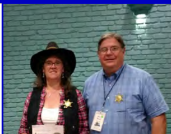
Civitans at the Helm - Helmsman