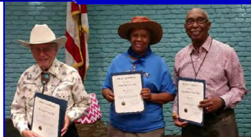
2015 - 2016 District Honor Clubs: Birming- ham, Phenix City and Greaser Titusville (not shown: Montevallo and Sylacauga)

Admiral: Auburn Gardendale Commodore: Center Point Fairfield Captain: Birmingham Montevallo Northport Tri County Navigator: Alexander City Irondale Greater Titusville Opelika Phenix City Sylacauga Wilsonville Helmsman: ACTION B'ham Brent Selma