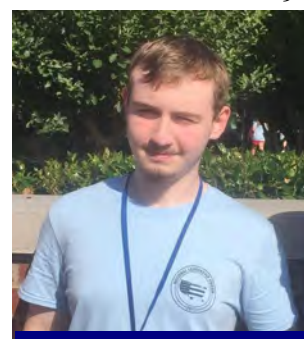
Center Point: Preston Hill