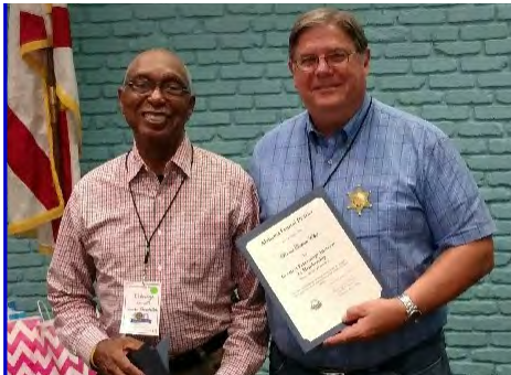
2015 - 2016 District Growth Awards