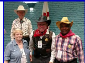
Civitans at the Helm - Commodores