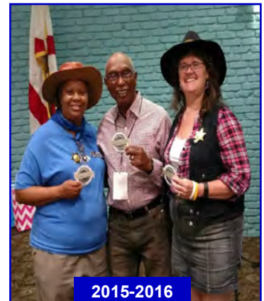
2015-2016 International Honor Clubs and Honor Club of Excellence