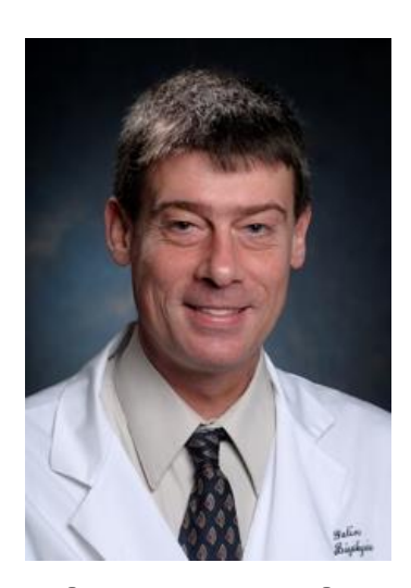
Shawn Galin Endocrine, Benos, & MS2 Module