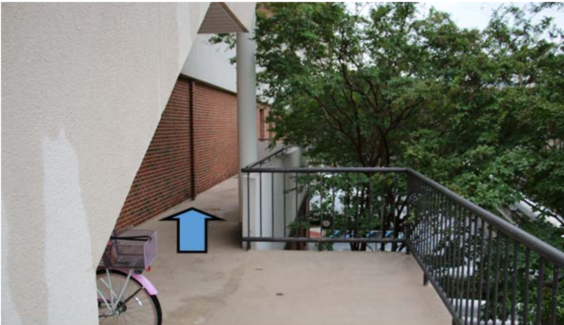
Continue down the path to the set of double doors on the left.