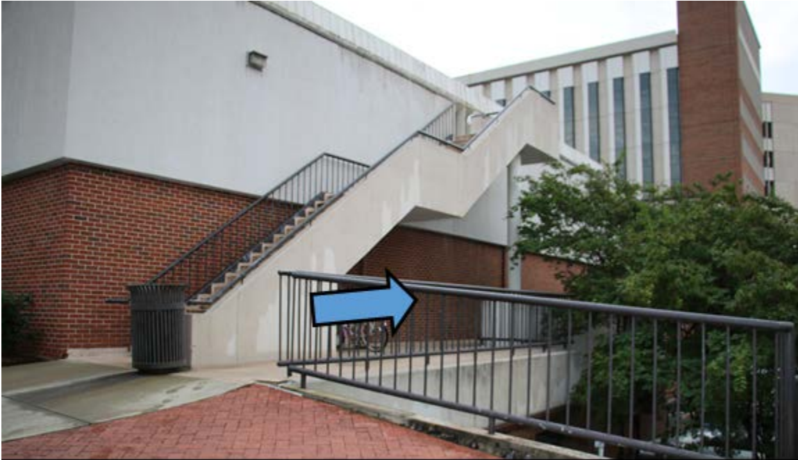
Turn right and walk past the stairs