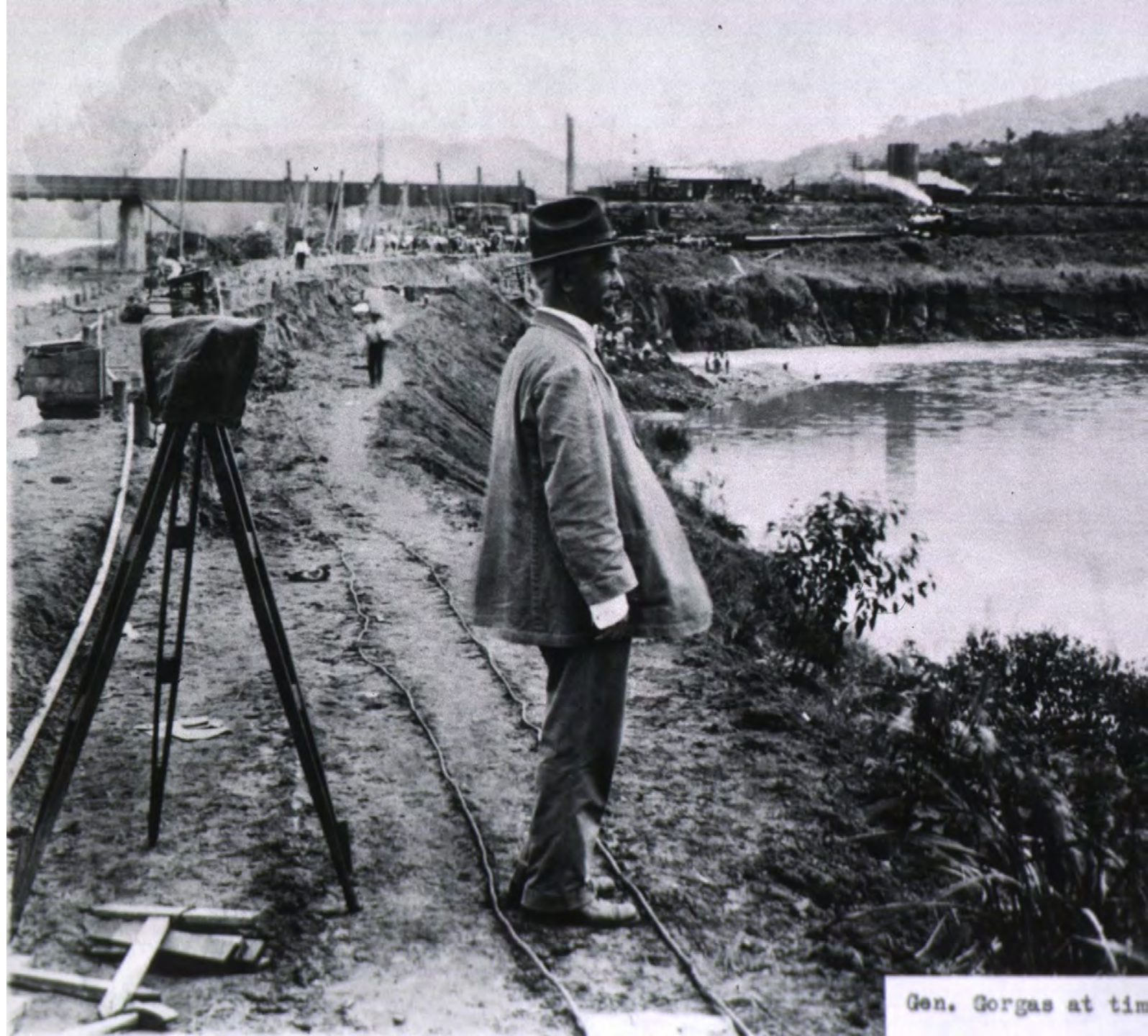
Gen. Gorgas at tim