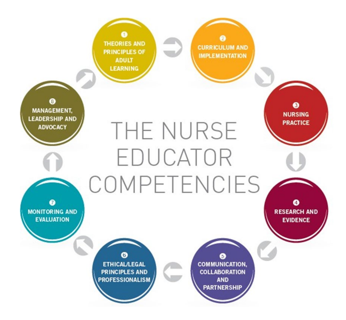
Figure 1: The nurse educator competencies and requirements [9]