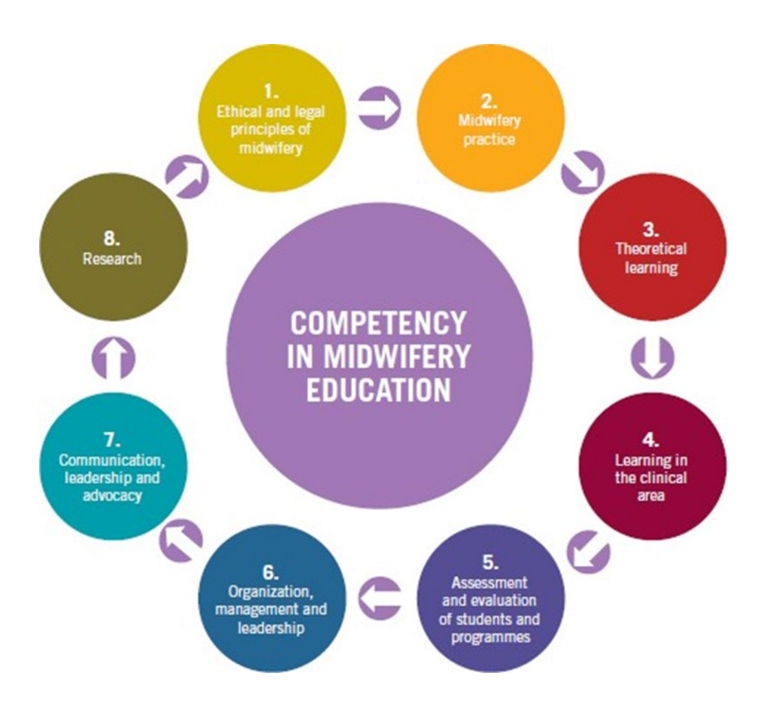
Figure 2: The midwifery educator competencies and requirements [8]