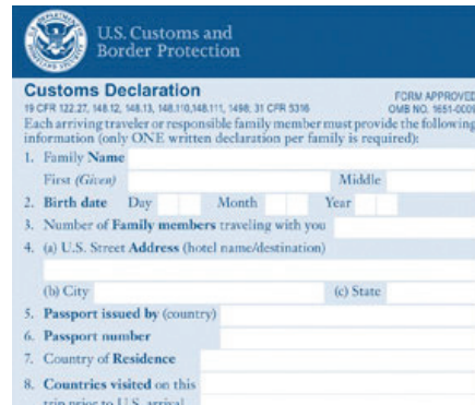
US Customs Declaration form

You may have to complete the US Customs Declaration form during your flight to present to the immigration official when you enter the US. For more information about preparing to enter the US, visit studyinthestates.dhs.gov/students