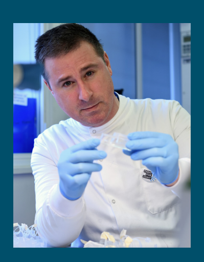
March 29, 2023

The mechanobiology of aqueous humour outflow