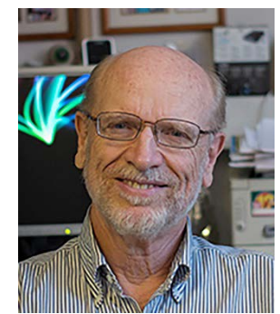
Neural Control of Choroidal Blood Flow and Retinal Health