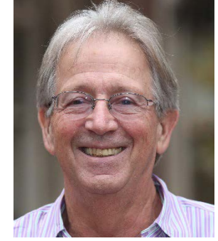
Understanding glaucomatous damage: An OCT approach