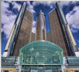
GM Renaissance Tower