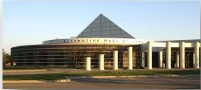
Automotive Hall of Fame

Detroit is very well known for its rich automotive history. Here are a few landmarks that are worth visiting: