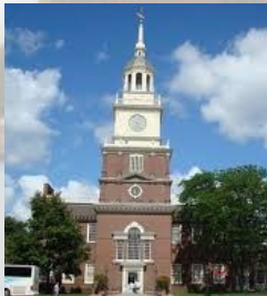
The Henry Ford Museum