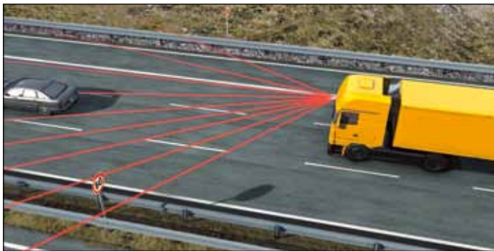
Area monitored by the Speed Alert system

Speed alert helps drivers maintain a correct speed, avoid speeding, and prevent speed related accidents. Speed Alert informs the driver about the speed limit of the road he/she is using and issues a warning when the driver is about to exceed them.