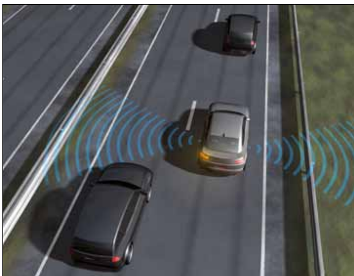
Areas monitored by the Blind Spot Monitoring System

Blind Spot Monitoring uses radar, camera or ultrasonic technologies to monitor the blind spot area of the vehicle. If a moving object is detected within the specified zone, a warning signal is issued. Warning signals vary from one version of the system to another and include visual, audio or haptic signals.