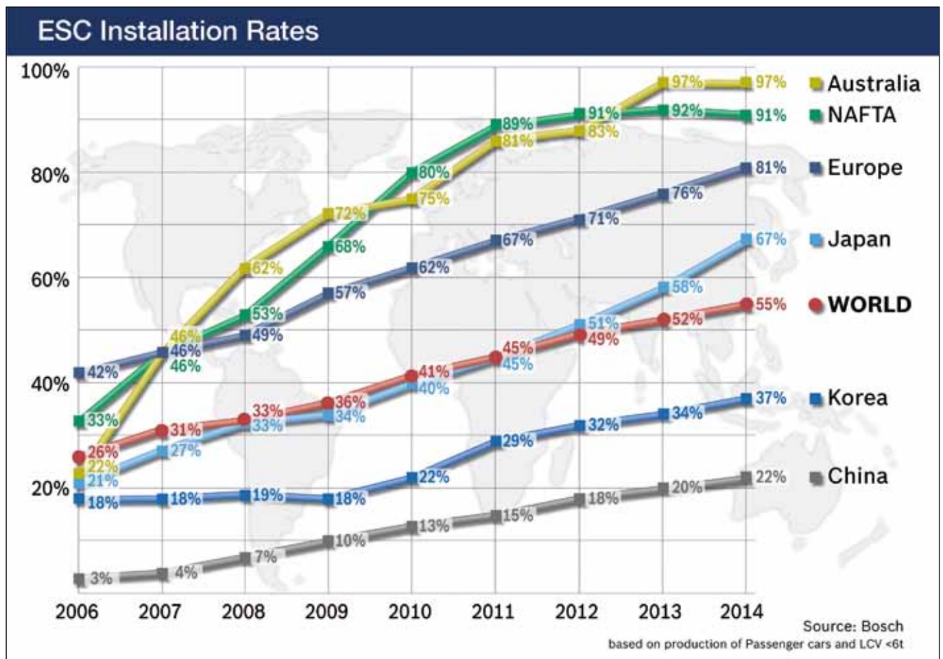
ESC installation rates worldwide

In 2008, only a third of the worldwide production of passenger cars and light commercial vehicles up to 6 tons were equipped with ESC. By 2012, it is estimated that every other vehicle will have ESC on board. The acceleration of ESC installation has been strongly influenced by the regulatory actions in US, Europe, Canada and Australia, and also the growth in ESC take-up in China, which is increasingly substituting ABS for ESC.