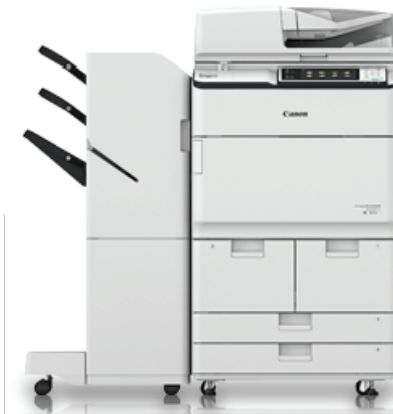
ImageRUNNER DX 529iF