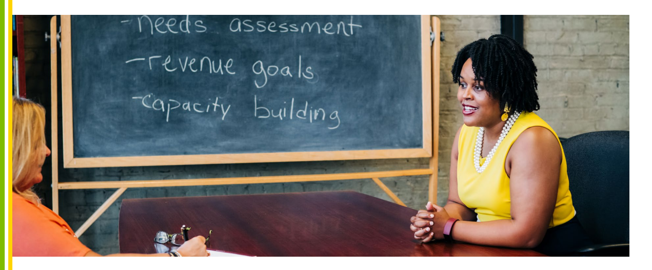
Post-doctoral Scholar Trainees (Assignment Category 20 & 21)

These UAB Medicine employees work 24-hours on weekends and other requested coverage periods.