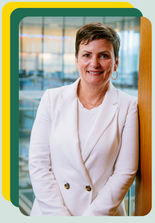
EXECUTIVE DIRECTOR'S LETTER

2023 was fantastic — a year packed with accomplishments, including three start-ups launched and several in the pipeline; the very first application round of our Blazer Bridge Fund, which resulted in six worthy UAB technologies each winning $50,000; and three new full-time employees, each of which has brought persistence, dedication and hard work to the HIIE. In November 2023, when some of our team were in Seattle to accept the Association of Public Land-grant Universities' prestigious Innovation Award, we found ourselves imbued with a sense of pride in what we've created here at the Harbert Institute. We are all grateful for the opportunity to serve the UAB community, and look forward to a robust, fruitful 2024.