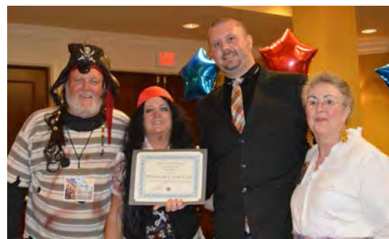
Wilsonville Civitan Club receives Outstanding Club of the Year Award