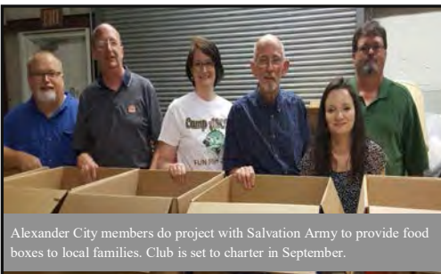
Alexander City members do project with Salvation Army to provide food boxes to local families. Club is set to charter in September.