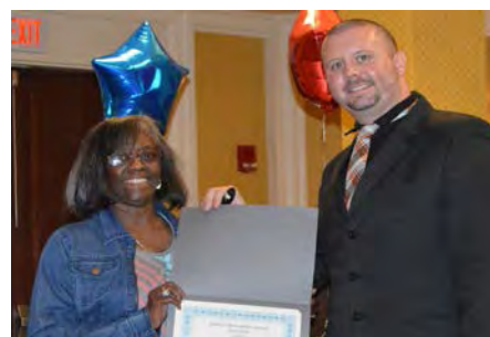
Greater Titusville receives Outstanding Club Newsletter Award