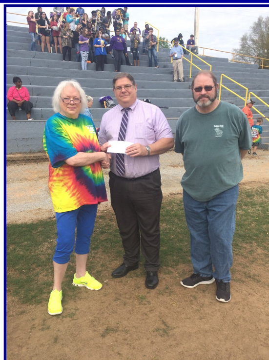
Brent Civitans spent a day helping with the Bibb County Special Olympics. Above members are shown presenting their monetary assistance.