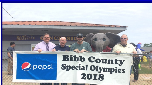
Brent Civitan Club Members take a break from working the concession stand to have their picture taken with the UA Elephant Mascot and "Blaze", the UAB Mascot.