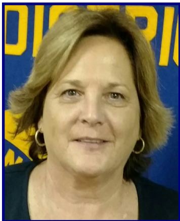
Judith Pike Governor