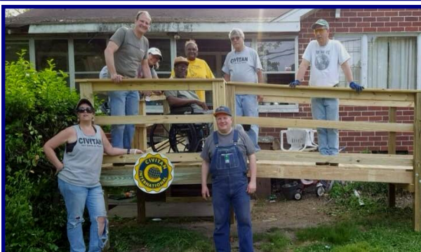
Members from Perimeter and Birmingham Civitan Clubs joined with members from ACTION Club to build a wheelchair ramp for the gentleman in the wheelchair.

All dates are current as proposed on publication