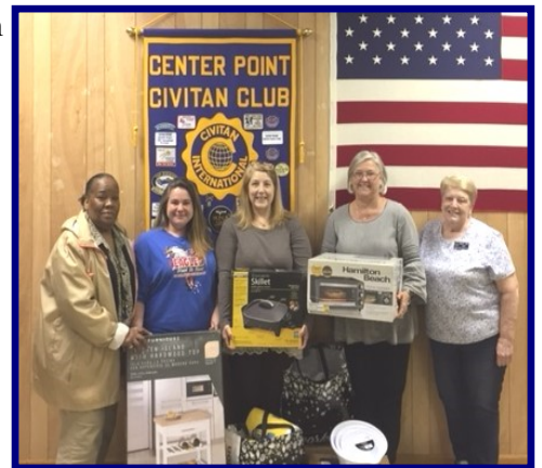
Center Point Civitans organize their collection for local Special Ed classes.