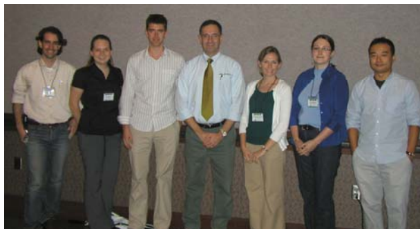
MCP 2008 Graduate Student Research Day