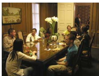
MCP 2008 Welcome Reception