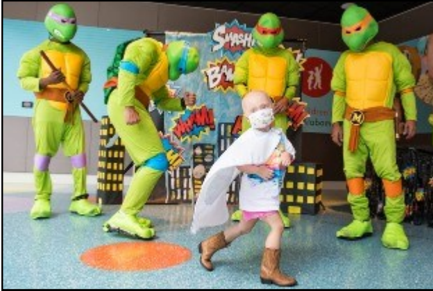
Teenage Mutant Ninja Turtles paid a recent visit to Children's of Alabama to visit with the kids and clean the windows. COWABUNGA DUDE! These Super Hero window washers are AWESOME!