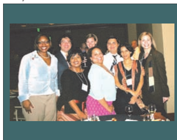
(Above): New PhD Students.

⇒Post Graduate Diploma in Business Administration and Masters in Health Administration at Latrobe University in Melbourne, Australia. ⇒Work Background: Banking industry and as a Project Manager at The Alfred, a public hospital in Australia; Symbiosis Institute of Health Sci-