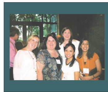
Above: Several members of Class 42 at Welcome Reception in September.