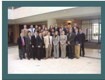
(Above): Class 42 Members during field trip at Medical Center East.

The following students were elected to lead MSHA Class 42. This year we have revised the class officer names and functions to reflect their true responsibilities. In addition, we have dedicated officers for the MSHA Classic, the golf tournament that began last year that will provide funding for the students' professional development expenses.