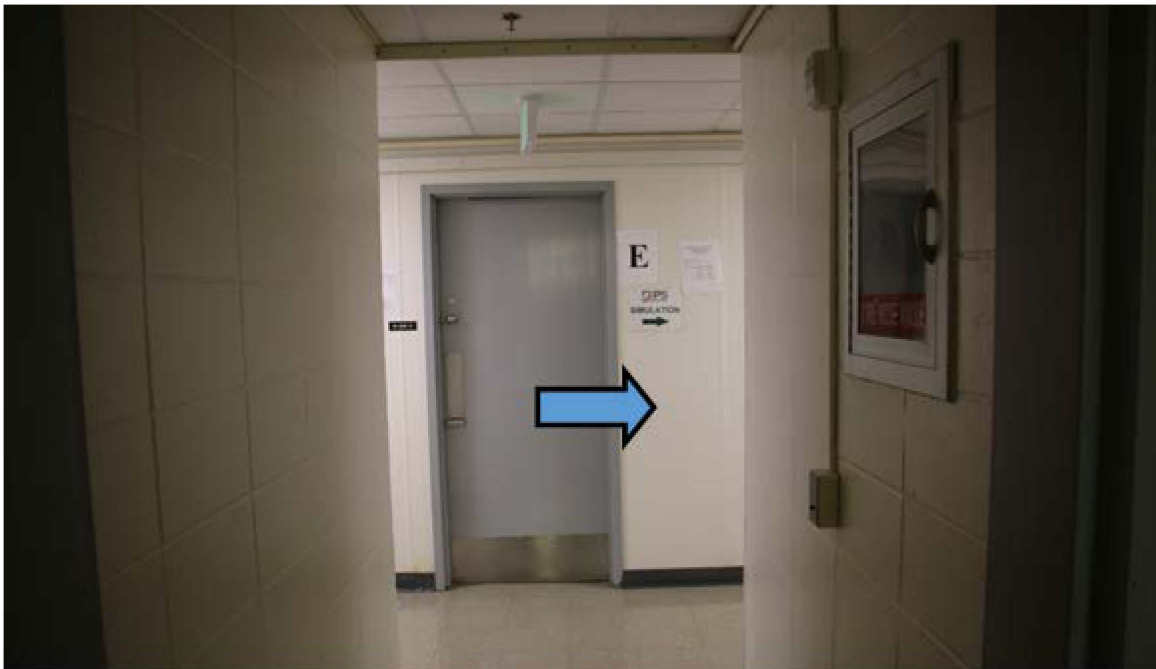
Turn right at the end of hallway