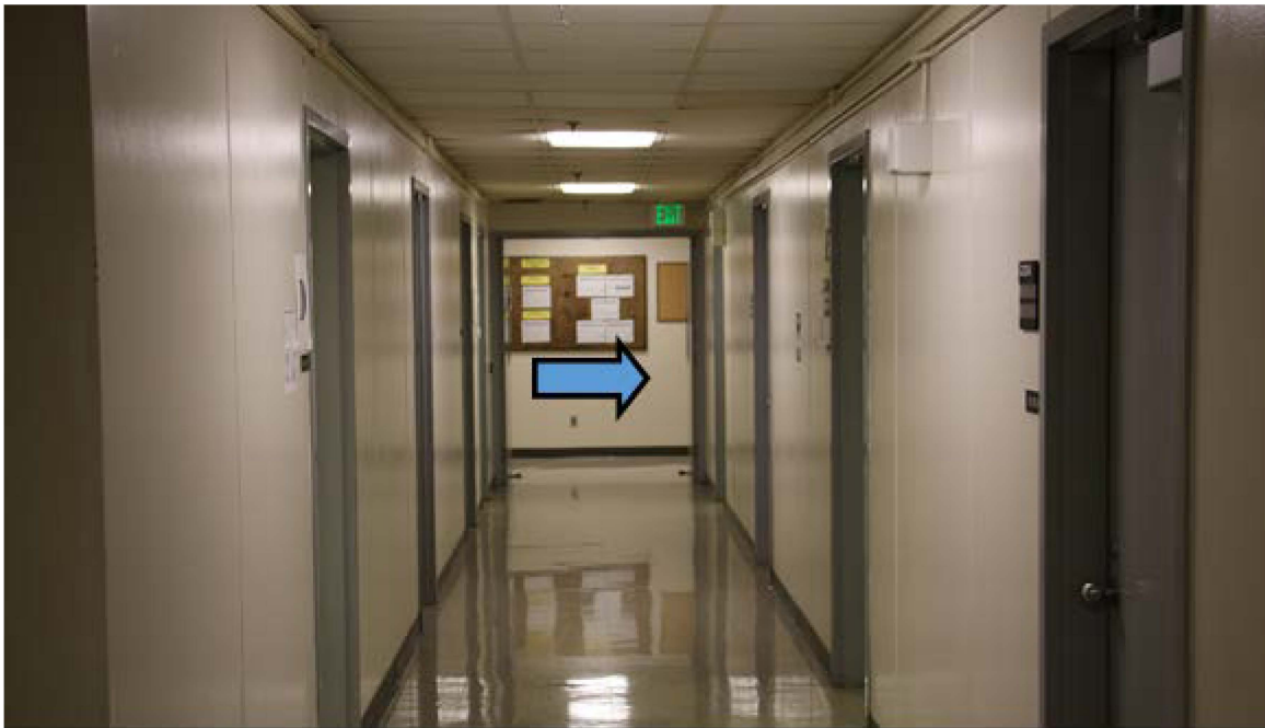
Turn right at the end of the hallway