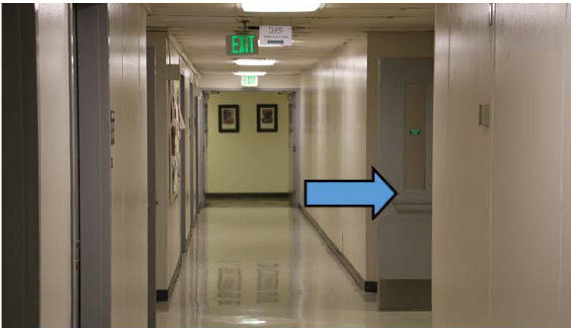
Turn right and continue through double doors.