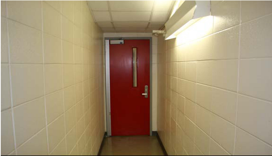
At the bottom of the stairs, exit through the door and turn right