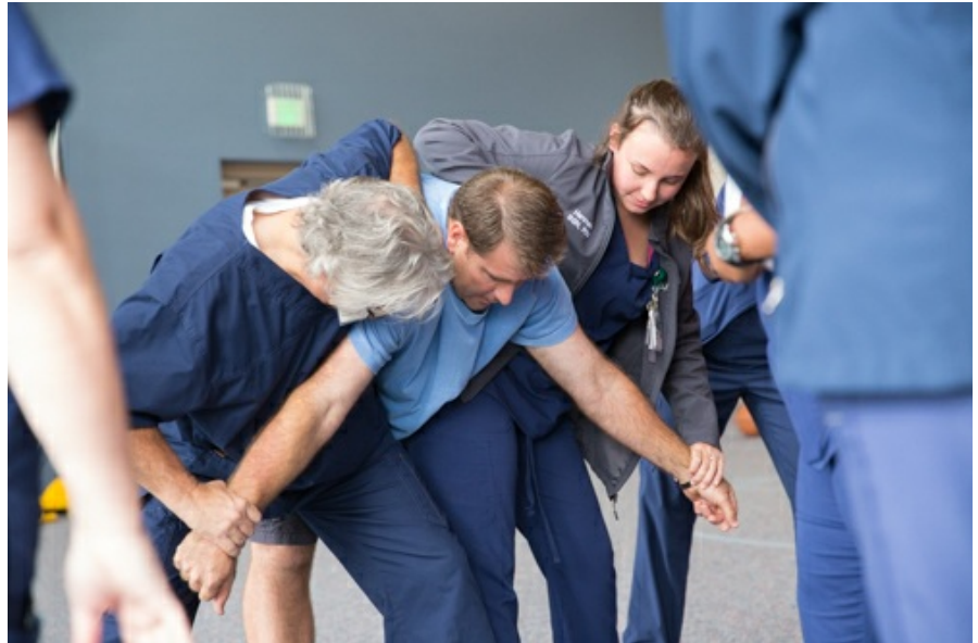
Center for Psychiatric Medicine De-escalation Simulation