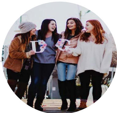
ΔΓ Delta Gamma