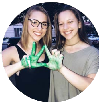
ΚΔ Kappa Delta