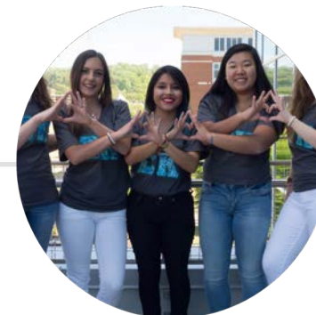
ΣΚ Sigma Kappa