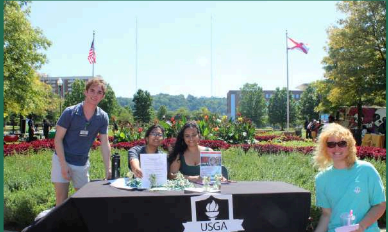
A Cameo From the President?!?!